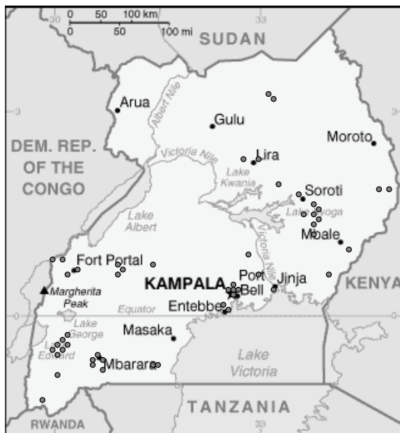
Figure 1: Distribution of facilities visited in Uganda

All of the facilities approached agreed to take part in the study. The sites that were visited are listed in Appendix E and their geographical distribution is shown in Figure 1. Each facility visit took approximately one day, with many requiring a return visit to complete data collection.