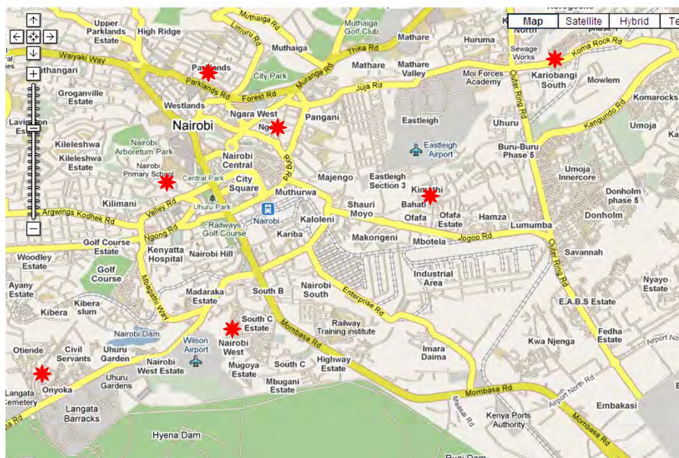
Figure 1: Map of project site location