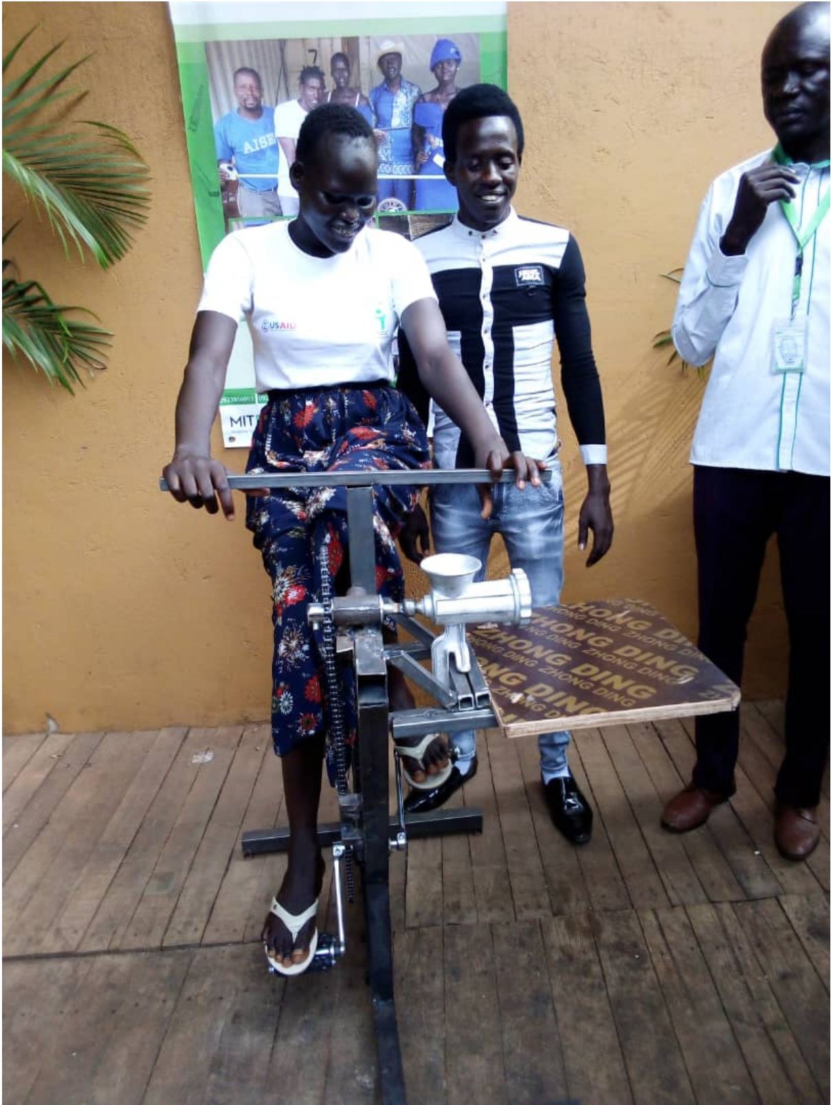
Figure 7. CCB participants demonstrating the paste maker.