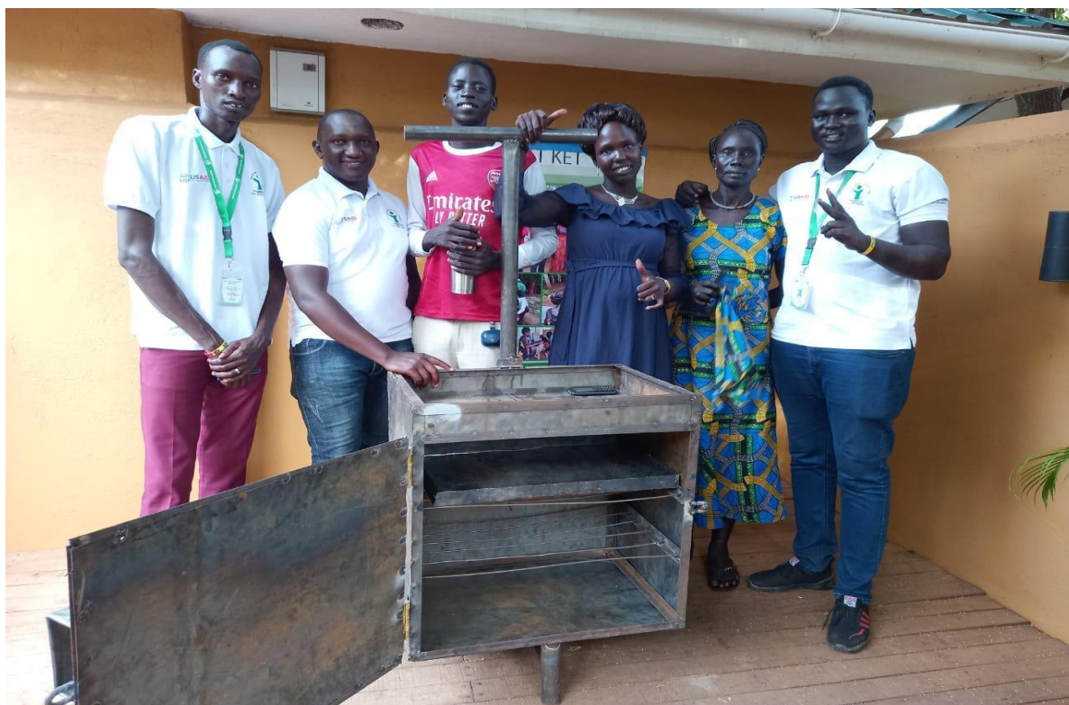
Figure 6: Photograph of the oven after refinement

The technologies were refined by teams of CCB participants from different project sites, a CCB Facilitator and a Facilitator. The teams reviewed the current state of the technologies, built a sketch model using cardboard and other materials, and received feedback from the team, other teams and Facilitators. For example, to increase the mobility of the oven, wheels and a longer handle were added to make it easier to move. To improve its functionality, a provision was added for firewood at the top and bottom, and a lock was added to keep the heat inside.