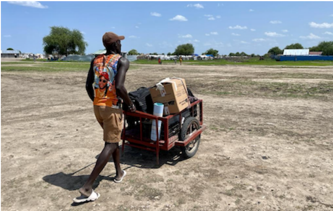
Figure 4. The Wheel Cart in Pibor.

Several months after its initial development, the group took the wheel cart to the Co-Creation summit for further refinement, including adding a roof made of plastic sheets. They would like to use metal sheets but can't currently access the materials.