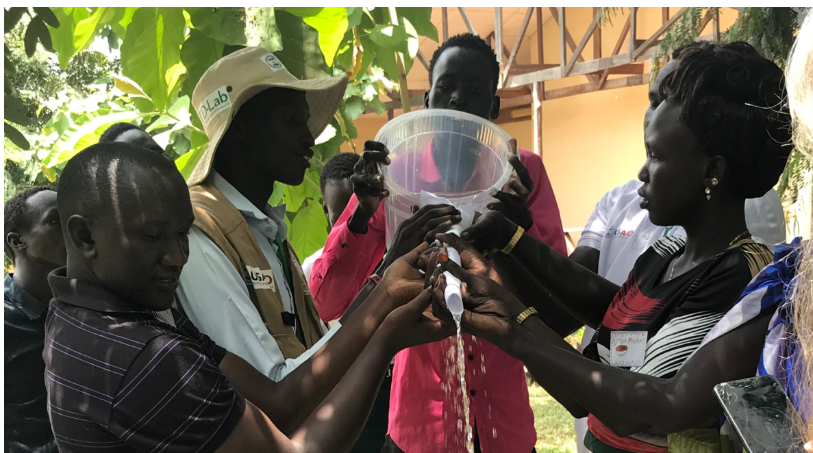
Figure 5. CCB participants and Facilitators test a water transfer prototype at the Co-Creation Event.

The Co-Creation Event took place in Juba over the period of five days. There were 24 participants in total, consisting of 12 CCB graduates who attended from Pibor and Duk, staff from YSAT and one representative from a Juba-based NGO. It aimed to help CCB participants refine the technologies and develop viable business models, and to promote social cohesion by building relationships between participants from different ethnic and age groups. The Event involved team building exercises, training on the design process, practical design lessons, a showcase of technologies developed and a reflection session. Four technologies were refined at the event: oven, wheel cart, paste maker and shoes made from recycled tyres 18 .