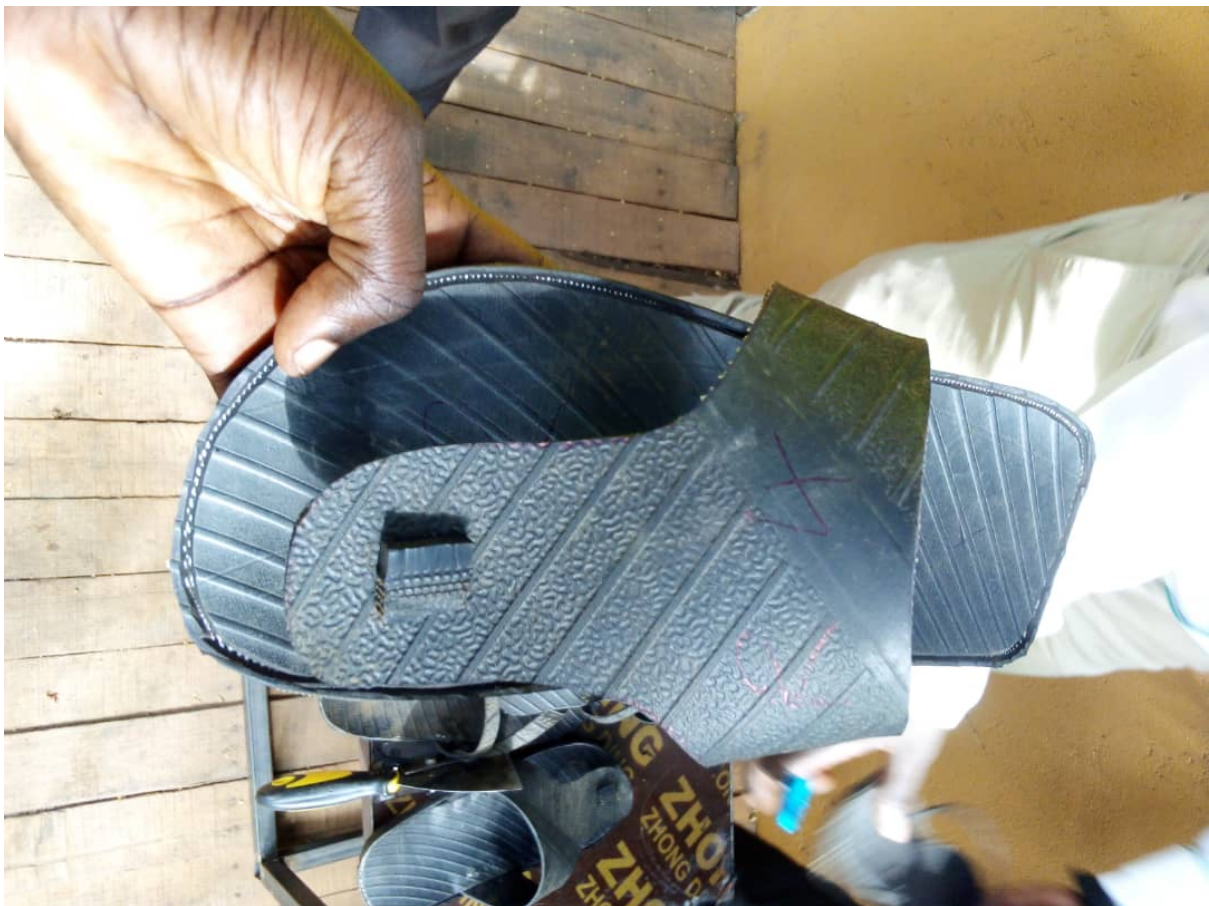
Figure 3. Shoes made by the participants and refined at the Co-Creation Event.

Some participants earned money by using the technologies to provide services . In Pibor, the group that made the wheel cart charged SSP 1000 - SSP 1500 to transport a sack of goods, and made up to SSP 10,000 per day. The group that made the oven used it to dry fish and game