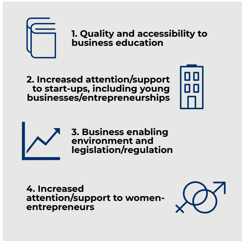
Figure 2: Most Important Changes in SME Development - Attributed to I3