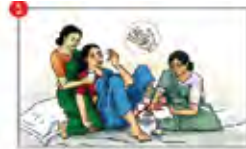
৪. মতল পরীক্ষার পরেই মতল পরীক্ষার ফলাফল ও টীকা লিপিবদ্ধ করে রাখা হবে।