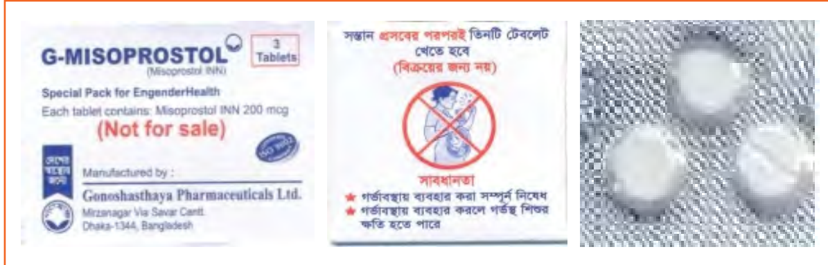
Misoprostol catch cover and three tablets