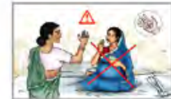
৭. মতল পরীক্ষার ফলাফল ও টীকা লিপিবদ্ধ করে রাখা হবে।