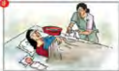
২. মতল পরীক্ষা করে পরীক্ষার ফলাফল ও টীকা লিপিবদ্ধ করে রাখা হবে।