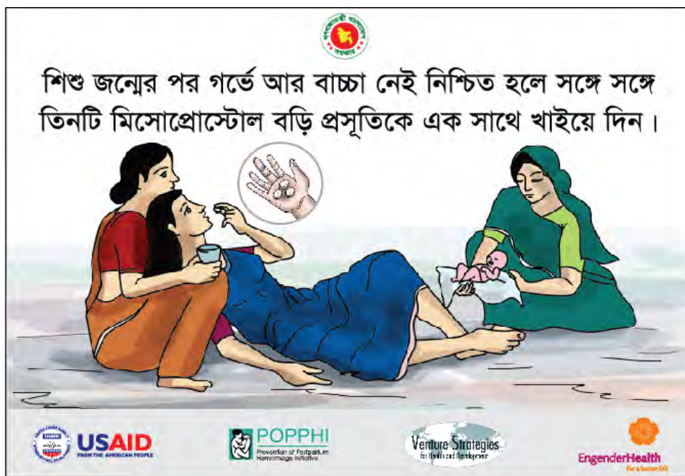
Sticker on use of Misoprostol