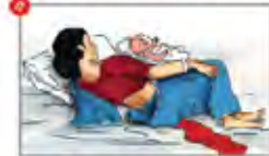
৬. মতল পরীক্ষার ফলাফল ও টীকা লিপিবদ্ধ করে রাখা হবে।