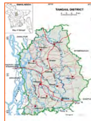
Figure 1: Map of Tangail District

The total population of Tangail District is about 3.2 million, and the intervention covered about 2.8 million people in the eight upazilas. The total estimated number of live births in the eight selected upazilas was 21,834 per year (see Appendix 1), of which approximately 18,559 deliveries were estimated to occur at home (85%, as per the 2007 BDHS).