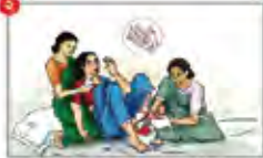
১. এই মতল ও পরীক্ষা কেবলমাত্র প্রসব হওয়ার পরেই করা হবে।