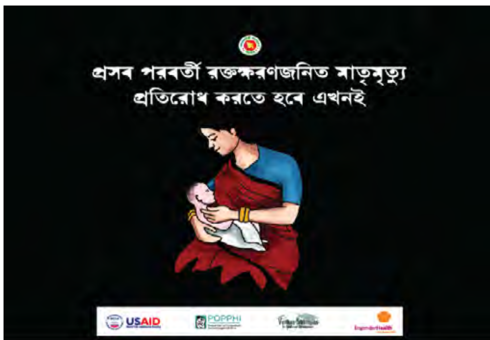
Flipchart on use of Misoprostol