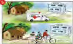
৩. একটি গৌণ বা দ্বিতীয় স্তরে সচেতনতা সৃষ্টি করা হবে।