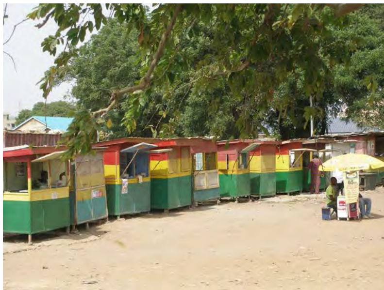
Ghana: Market Place in Accra.

guarantees. However, the growth largely reflects the bank's ongoing strategy to increase retail lending (including SME lending) rather than being attributable to the guarantees. Experience with the guarantees prompted EcoBank to increase lending to some new industries and to extend some long-term loans for capital expenditures outside of the guarantee coverage. Although there has been an increase in lending to the sector, the question of attribution remains: lending to SMEs has been increasing substantially in Ghana since 2002 (pre-guarantee). Anecdotal evidence suggests that loan guarantees may be responsible for some of this increase. However, given the small number of industries/sectors represented by