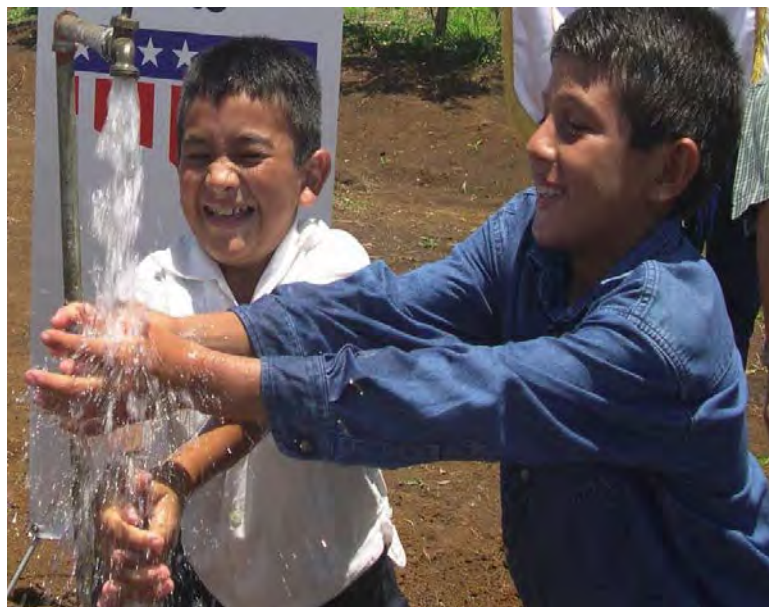
Honduras: Children Playing with Water

EcoBank's guaranteed loans, the effect of the DCA guarantees is likely modest.