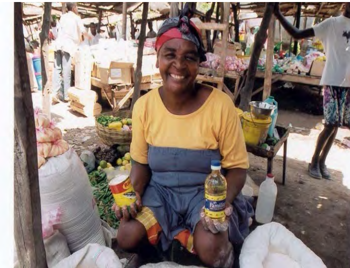
Haiti: A woman entrepreneur supported by USAID.

In Haiti , on Financial Additionality, SOGEBANK used the DCA to reach out to more productive sectors, although it mitigated the potential risk involved by limiting the number of loans given to new borrowers. Capital Bank did not use the DCA to extend its market, but rather as a reserve to cover a set of clients who had problems paying back their loans. In terms of Economic Additionality, borrowers from SOGEBANK and from Capital Bank became more willing to seek credit after they had received their first loan. The fact that borrowers obtained additional loans suggests they likely increased their business sales.