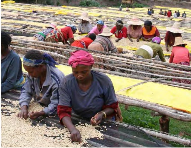
Ethiopia: Women Sorting Coffee

In Ethiopia , Bank of Abyssinia (BOA) used the guarantees to subsidize collateral requirements for guaranteed borrowers. Between 2000 and 2008, the USAID guarantees were responsible for increasing BOA's lending to the agriculture sector from 0 to an average of 2.3% of its total value of loans disbursed during the period. The USAID guarantees encouraged BOA to enter the agriculture finance sector, and the bank will likely continue to lend to this sector, but only to exporters for the near future. BOA continued to lend to 20% of the formerly USAID-guaranteed borrowers because they were