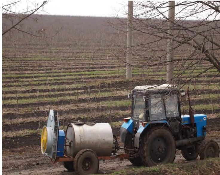
Moldova: Tractor in a field.

In Moldova , FinComBank aggressively used the DCA guarantee to make loans to the agricultural sector, reaching the maximum guarantee authority in less than two years of the five-year guarantee. The DCA guarantee allowed the bank to implement and test its strategy to expand its presence in less-served rural markets. The guarantee helped FinComBank make loans to borrowers who would have been denied loans due to insufficient collateral and/or lack of credit history. More than half of FinComBank's DCA-guaranteed loans were extended to previous bank clients. Despite this, FinComBank significantly increased its agricultural loan portfolio during the guarantee period. At the end of 2009, FinComBank loans to the agricultural sector were just under 25% of its total loan portfolio versus about 15% for the banking system as a whole. Almost half of the DCA borrowers remain clients and still receive loans from FinComBank without any guarantees. While the $4 million FinComBank guarantee was too small to have a broader market impact, the overall $27 million Credit Enhancement Program 8 probably did have a marked impact on lending to the agricultural sector. As a result, there is growing competition among Moldovan banks to lend to rural borrowers, and there has been a shift in lending from larger agricultural enterprises to smaller agricultural producers.