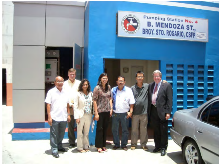
Philippines: DCA Evaluation Team and local partners in front of San Fernando pumping station.

In the Philippines , the DCA guarantee was used by LGUGC to improve access to private sources of credit for local governments and water districts where little or none had previously existed, although the volume of lending was less than anticipated due to adverse external influences. The DCA guarantee assured rigorous oversight and was critical in establishing the credibility of LGUGC among private financial institutions and other stakeholders. The DCA guarantee led LGUGC to guarantee loans to the target sectors without the DCA re-guarantee. Since private financing effectively played no role in the target sectors before the